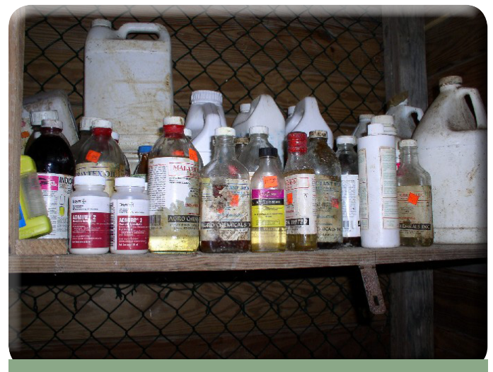
Hazards posed by these chemicals should be clearly shown on the labels

Last year, the Environmental Protection Department, with assistance from the United Nations Institute for Training and Research (UNITAR), submitted a project proposal to an international funding agency for a grant. The proposed project, "Development of a National Implementation Strategy for the Globally Harmonised System for Classification and Labelling of Chemicals in Barbados (GHS)" was approved in the first quarter of 2010.