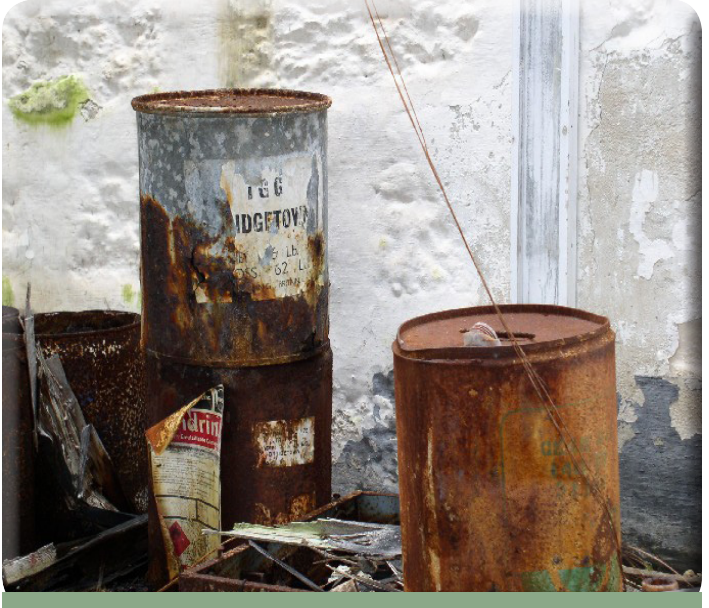
Old drums possibly containing a POPs pesticide

The term POPs stands for Persistent Organic Pollutants, which are a category of highly dangerous organic chemicals. Exposure to POPs, even at low concentrations, has been linked to a range of illnesses in human beings and animals. Studies have found that exposure to POPs can result in reproductive disorders, immune system disorders and cancer in humans, among other things.