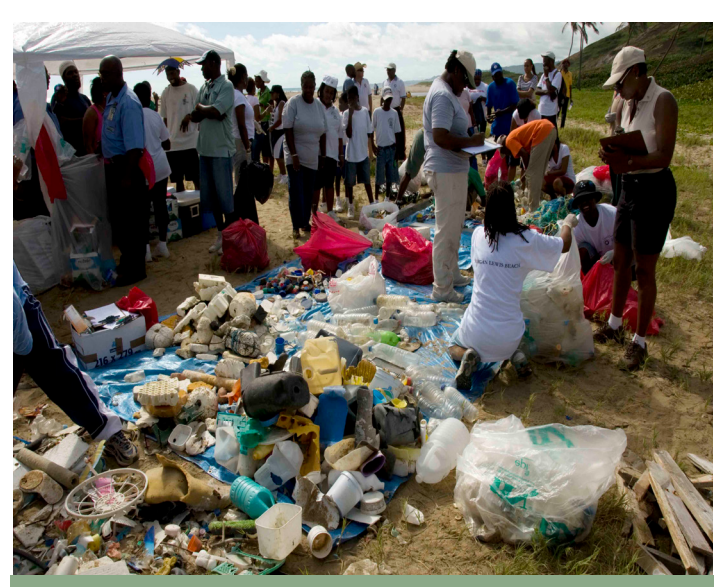
Volunteers sorting waste collected

However, the large quantity of waste collected on the beach in 2009 is a clear indication that many people are not disposing of their waste appropriately and that more needs to be done to educate the public about the effects their behaviours have on the environment.