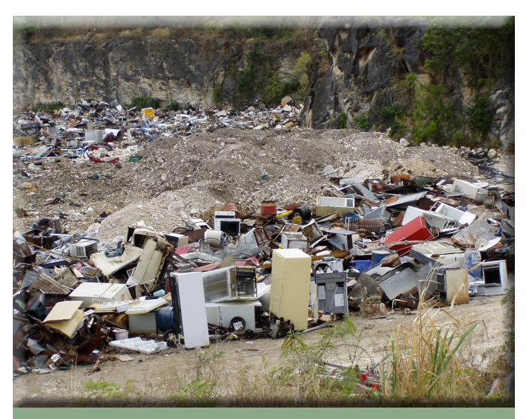
Electronic waste and other solid waste being disposed at the Bagatelle Bulky Waste Disposal Site.

While this policy is being developed, you can still play your part. Make sure to dispose of your e-waste properly, because out of sight may be out of mind, but the effects of your actions could affect your life.