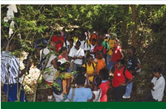
In The Whim Gully